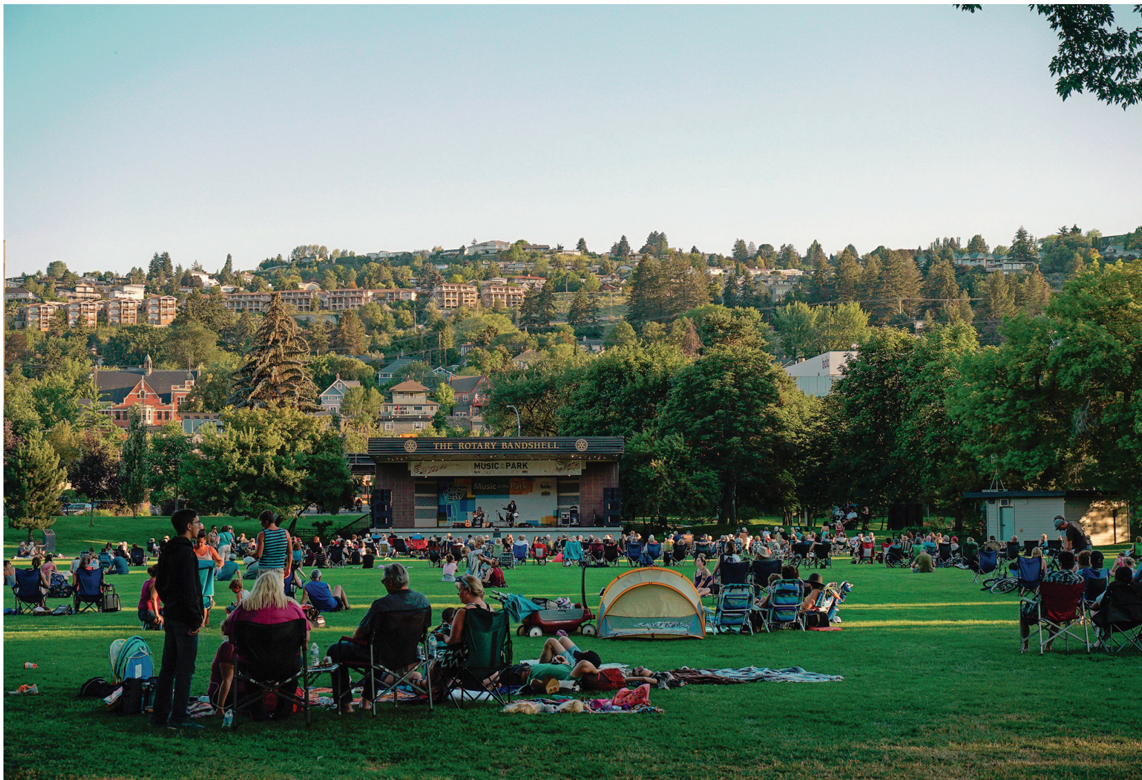
Kamloops Music in the Park BC Ale Trail