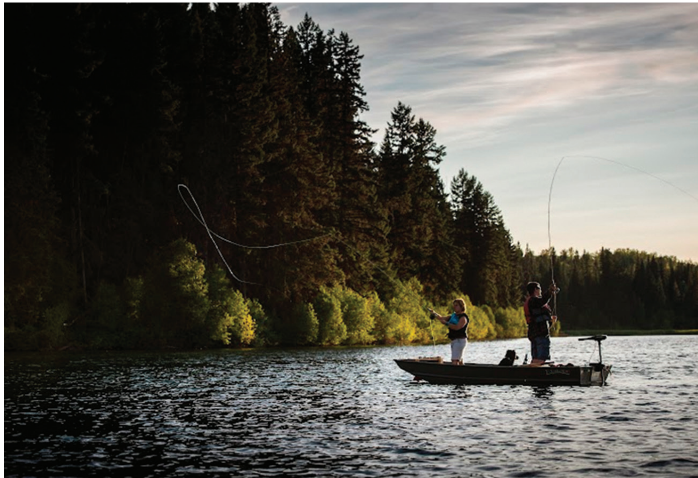
Fly-fishing from a boat at Fawn Lake Resort